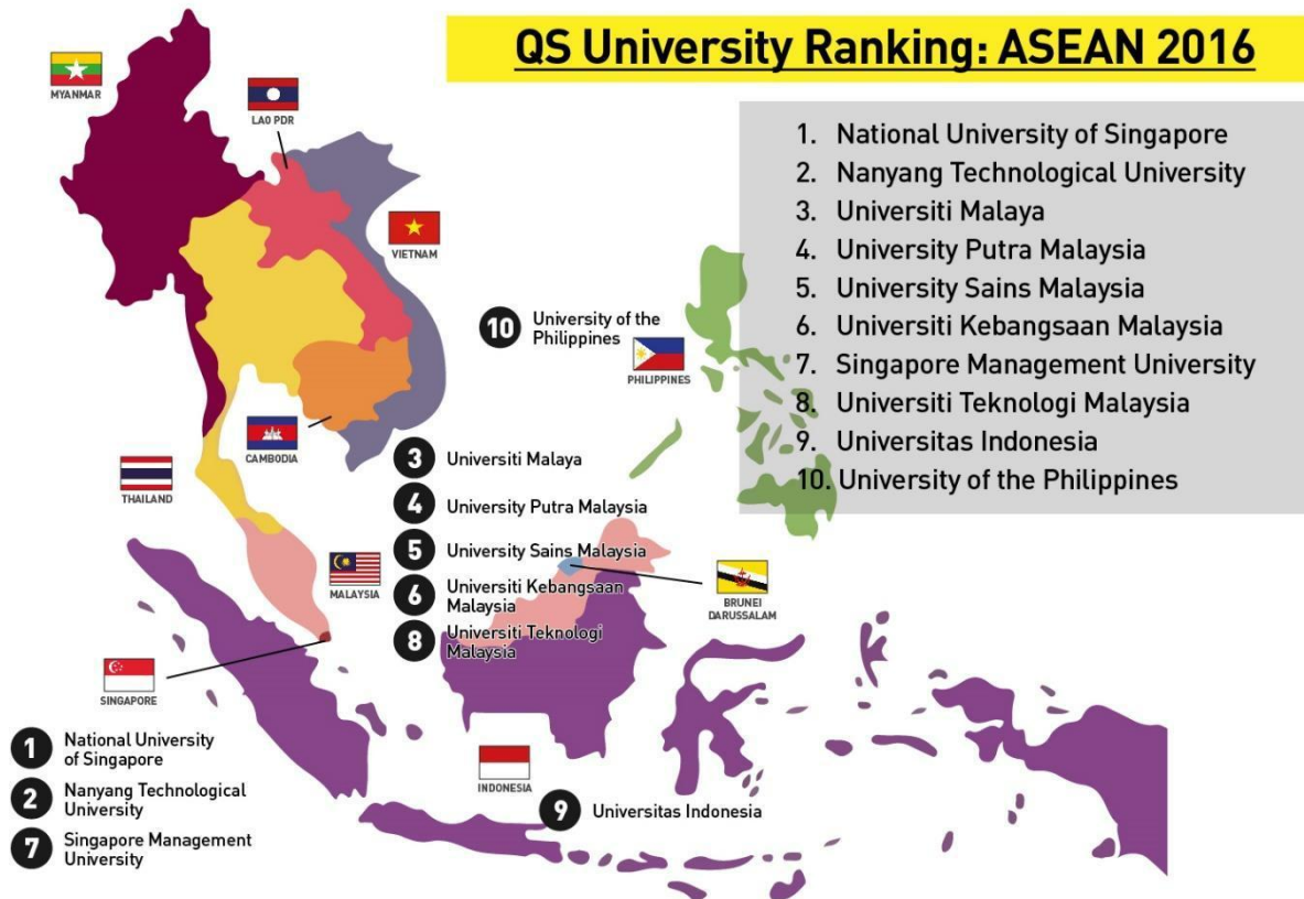
Picture 1. QS University Ranking in 2016